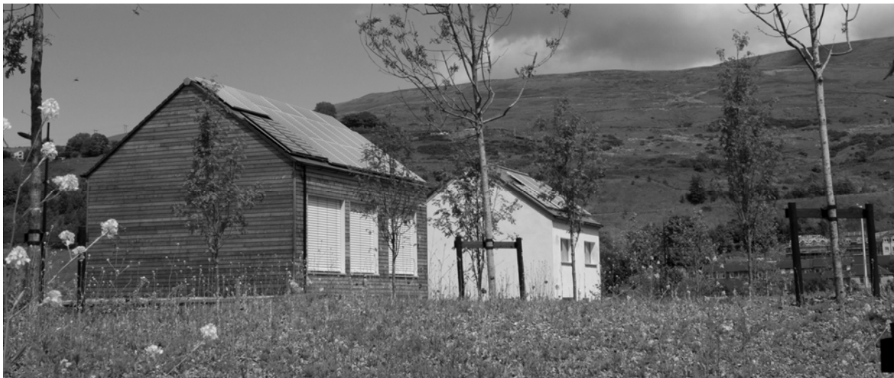
Figure 1: PH Certified Larch House (left) and PH Certified Lime House (right) in Ebbw Vale, Wales.